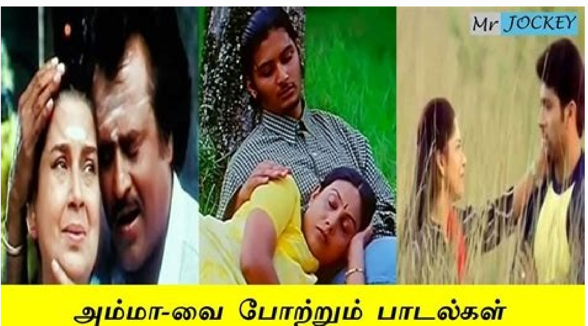
Amma appa feeling video songs download. Amma feeling video songs download in tamil sharechat.